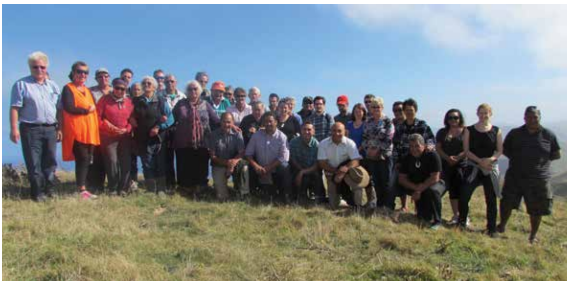
Group photo of the Ngāti Kahungunu Ki Wairarapa – Tāmaki Nui ā Rua Trust Negotiators with claimant whānau and Crown Officials during the officials site visit on 18 and 19 February 2014.

Through the length and breadth of our rohe various sites of significance have been visited with Crown officials over the past twelve months. We have prepared a detailed booklet on these visits which is available on the website, or from the Trust office. Many of the site visits have been filmed for future reference. These site visits proved not only informative for the Crown officials, but also serve as a reminder of the rich history of our rohe.