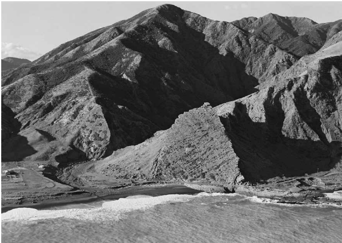
Above image: Nga Rā a Kupe (Kupe's Sails). This striking geological formation is part of the complex of places and wahi tapu associated with the explorer Kupe. The resemblance to a canoe sail is obvious. Part of the formation was damaged by blasting during construction of the road to the lighthouse after the Second World War. The site is subject to current Treaty of Waitangi settlement negotiations with the Crown.