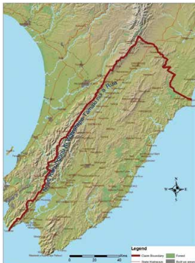
Ngāti Kahungunu Ki Wairarapa – Tāmaki Nui a Rua Claim Boundary NOTE: This area of interest is for the purposes of the negotiations for the settlement of the Ngāti Kahungunu Ki Wairarapa – Tāmaki Nui a Rua Claims and does not delineate iwi boundaries.