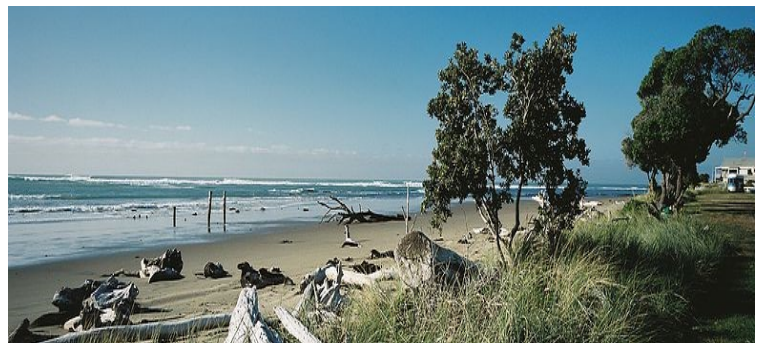
Coastal View: Akitio Beach—Tamaki Nui ā Rua

Postal Address: PO Box 756, MASTERTON ~ Physical Address: 189 Queen Street Rear, MASTERTON ~ Freecall: 0800 KKWTRN (0800 559 867) ~ Phone: 06 216 1277 (Masterton & Carterton) ~ Email: admin@kkwtrn.org.nz ~ Website: www.kkwtrn.org.nz