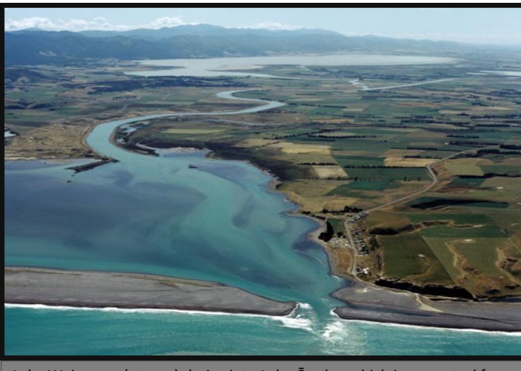
Lake Wairarapa (at rear) drains into Lake Ōnoke, which is separated from the sea by a 3-kilometre gravel spit.

In this issue we have asked some of our trustees and alternates about their aspirations and personal experience on the claims journey. See our first 3 profiles on page 2!